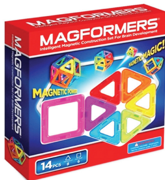
Magformer Magnetic Building Set