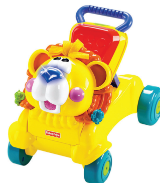
Fisher Price Walk and Ride Lion