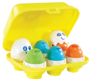
Tomy Hide 'N' Squeak Eggs

See below some of the exciting new purchases we've made and there are plenty more from the 'Wooden Toy Box' and also some 'Princess Duplo' waiting to arrive! Remember, we would appreciate any suggestions for appropriate toys to buy so please pop your ideas into our Suggestion Box located beside the check in counter at the Toy Library.